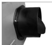
Plastic Backdraft Damper