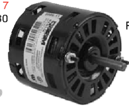
Fig. 8 R90575