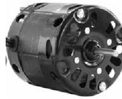
Fig. 3 R306 R322 R410