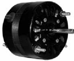
Fig. 2 R304 R317 R308 R320 R309 R325 R311 R395 R315