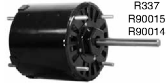
Fig. 4 R337 R90015 R90014