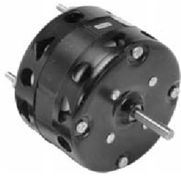
Fig. 1 R302

Sleeve & Ball Bearing - Shaded Pole & P.S.C.