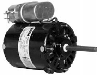
Fig. 5 R370 R371 R91125