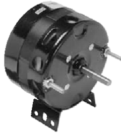
Fig. 6 R130 R326